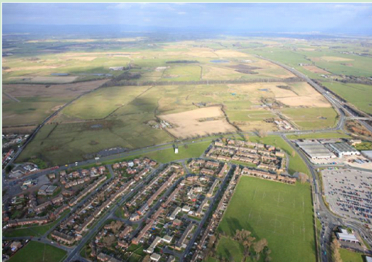
Whyndyke Farm - Blackpool

The LPB was established in 2005 to lead and support a programme of change within mental health services across Lancashire