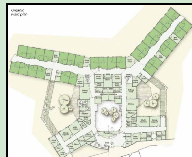
Organic ward plan