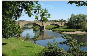
River Ribble, Littletown.

The LPB was established in 2005 to lead and support a programme of change within mental health services across Lancashire