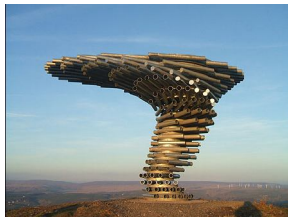
The Singing Tree, Burnley

In Autumn 2007, the Partnership Team began a piece of work around mental health wellbeing, sending out questionnaires and carrying out a series of Lancashire wide events with service users, carers and staff working in health and social care. The aim was to help develop and produce a new set of 'mental health outcome indicators' ( ways of monitoring if/how services are meeting the needs of service users ) and for these to be piloted in one of the five Lancashire primary care trust areas. NHS North Lancashire have agreed to become the 'demonstration site' to pilot this work.